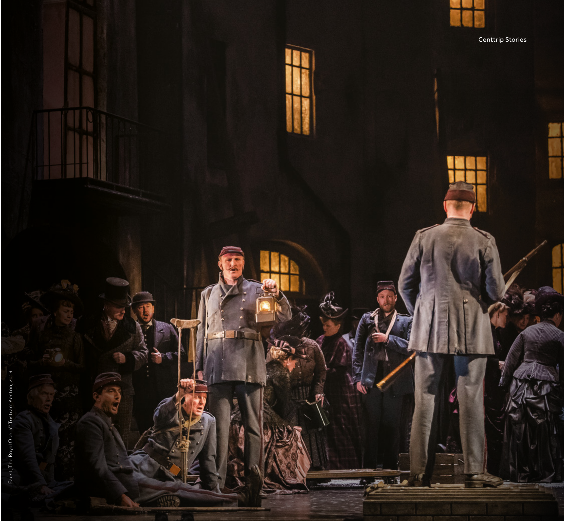
Faust, The Royal Opera® Tristram Kenton, 2019