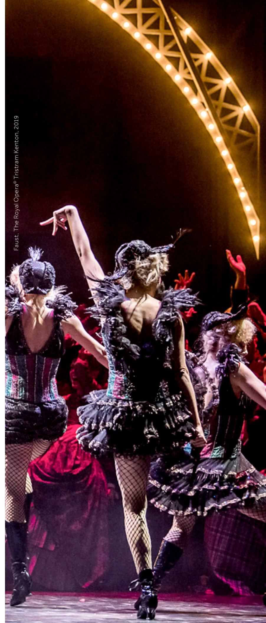
Faust, The Royal Opera® Tristram Kenton, 2019

As planning commenced for the 2019 tour, the finance team looked for a better way to handle daily allowances.